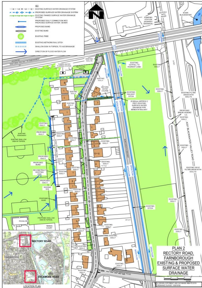
1: Rectory Road existing and proposed surface drainage